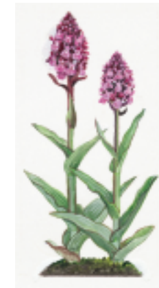
Southern Marsh Orchid