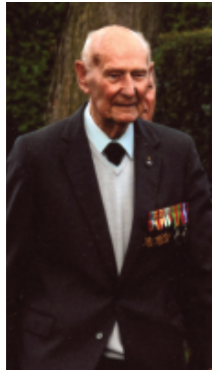
British Legion Event 2008