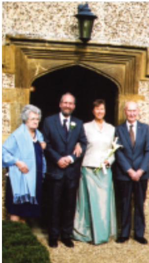
Sulgrave Manor 2002