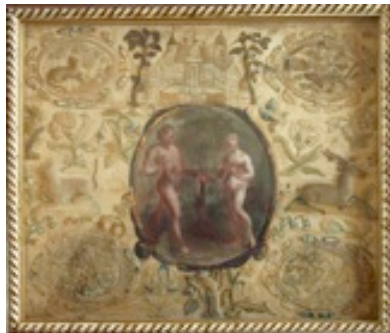
Stump Work Embroidery c1650