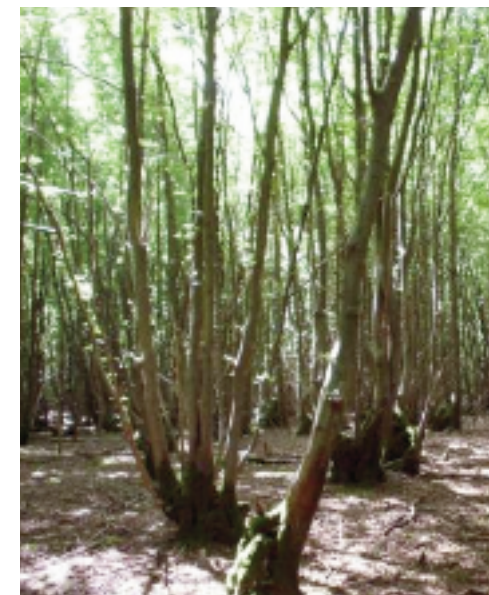
Typical hazel growth.