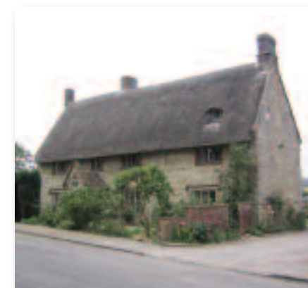
Dial House Farm