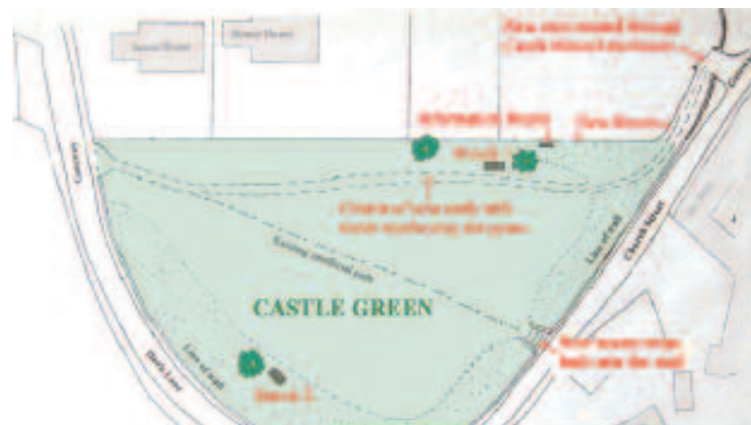
PLAN OF THE CASTLE GREEN RESTORATION & ENHANCEMENT PROJECT