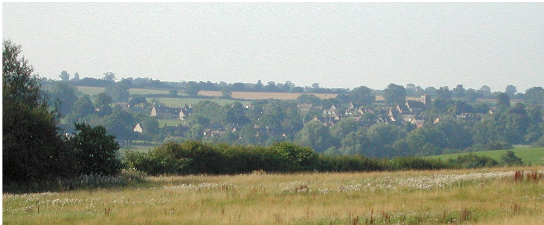
View from the top of the Moreton Road

with a hedge on your right. You will see a telegraph pole with a waymarker pointing across the open field to the right side of a wood ahead. Keeping the wood on your left carry straight on coming out into a large field with a mixed hedge on your right and lovely views to your left. At the end of this field keep straight on, passing a new wood of mature trees and you cross a stile next to a 5 bar gate. You can now begin to see Sulgrave and the top of the church in the distance. Pass some horse jumps in the hedge on your right and ignore the stile. The jumps are part of the Team Chase held here every October. Carry straight on into another field and after about 150 yards you