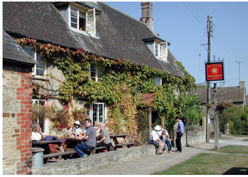
The Star Inn